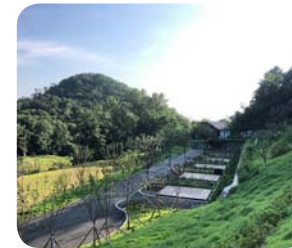
Cheonwangsang Family Camping Site

Location: 149-1, Hang-dong (149, Yeondongro 12-gil), Guro-gu Size: 30 (Auto: 18, Regular: 12)